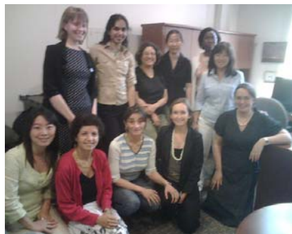
POWER Study Staff

We are pleased that there is interest in the tools we have developed. The Ontario Health Quality Council will include several POWER study indicators in its 2008 annual report. The Public Health Agency of Canada has requested permission to use our online survey and indicator selection criteria.